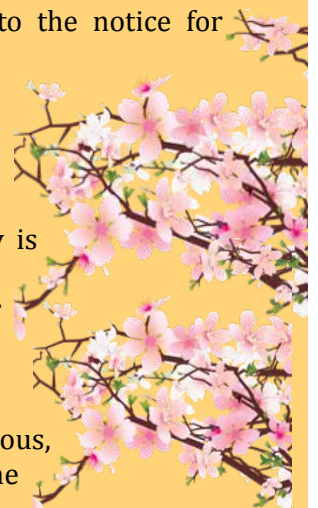
Photo Taking Days

The photo taking days for our school will be from 19th to 23rd March 2018. Your child will have both individual and class photos taken. Parents will receive sample individual photos and the class photo will be posted on the reception boards for you to view. It is OPTIONAL for parents to order the photos. The photos will be also be used for our school year book.